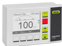
Interface I-100 Economical vacuum regulation