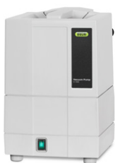
Vacuum Pump V-100 Economical vacuum source