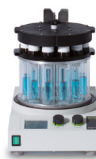
Multivapor™ P-6 / P-12 Efficient evaporation for multiple samples