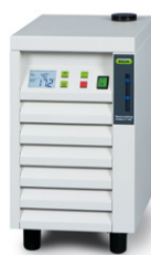
Recirculating Chiller F-100 / F-105 The easy way of cooling